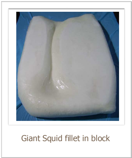
Giant Squid fillet in block